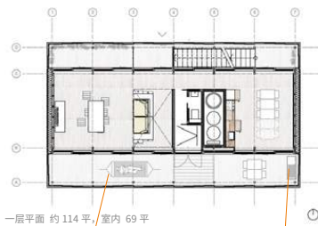
一层平面 约 114 平，室内 69 平